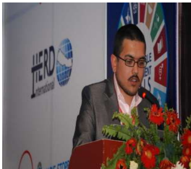
Oral and Poster presentations made by HERD during the event